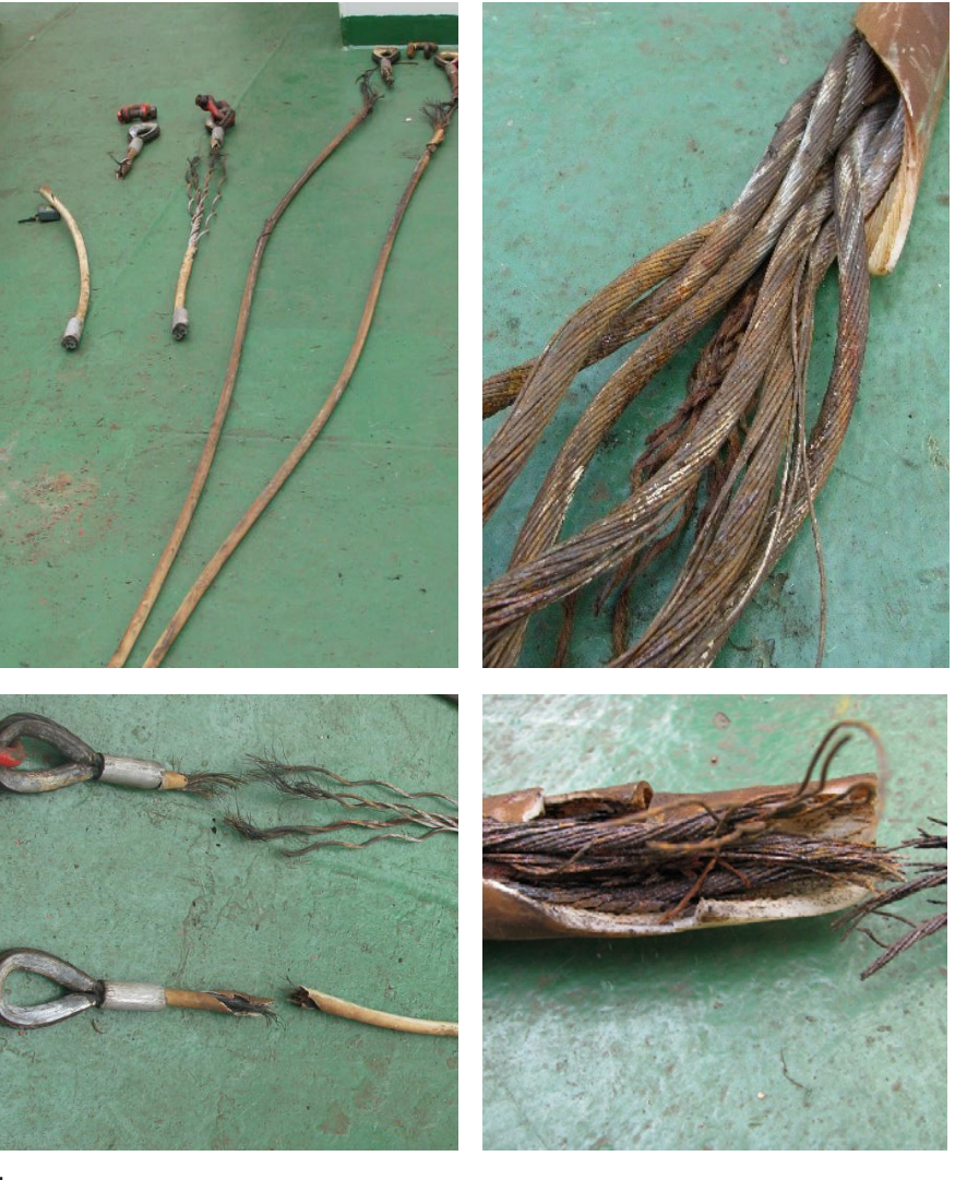
Figure 3. Lifting slings parted due to undetected corrosion.

Furthermore, while it is a requirement under SOLAS Chapter III, Regulation 20.4 that falls used for launching of lifeboats are renewed when necessary if found deteriorated, or at intervals of not more than 5 years - there is no requirement in SOLAS for renewal of the slings used in secondary means of launching of freefall lifeboats. As such, many owners of vessels do not consider renewing the slings, as the true condition of the encased wire ropes cannot be correctly determined.