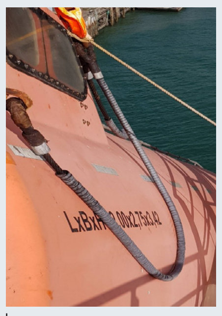
Figure 4. Alternative sheathing arrangement which allows for inspection