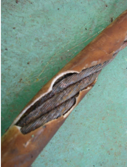
Figure 2. Corrosion beneath plastic sheathing.